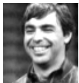
Page & Brin Google